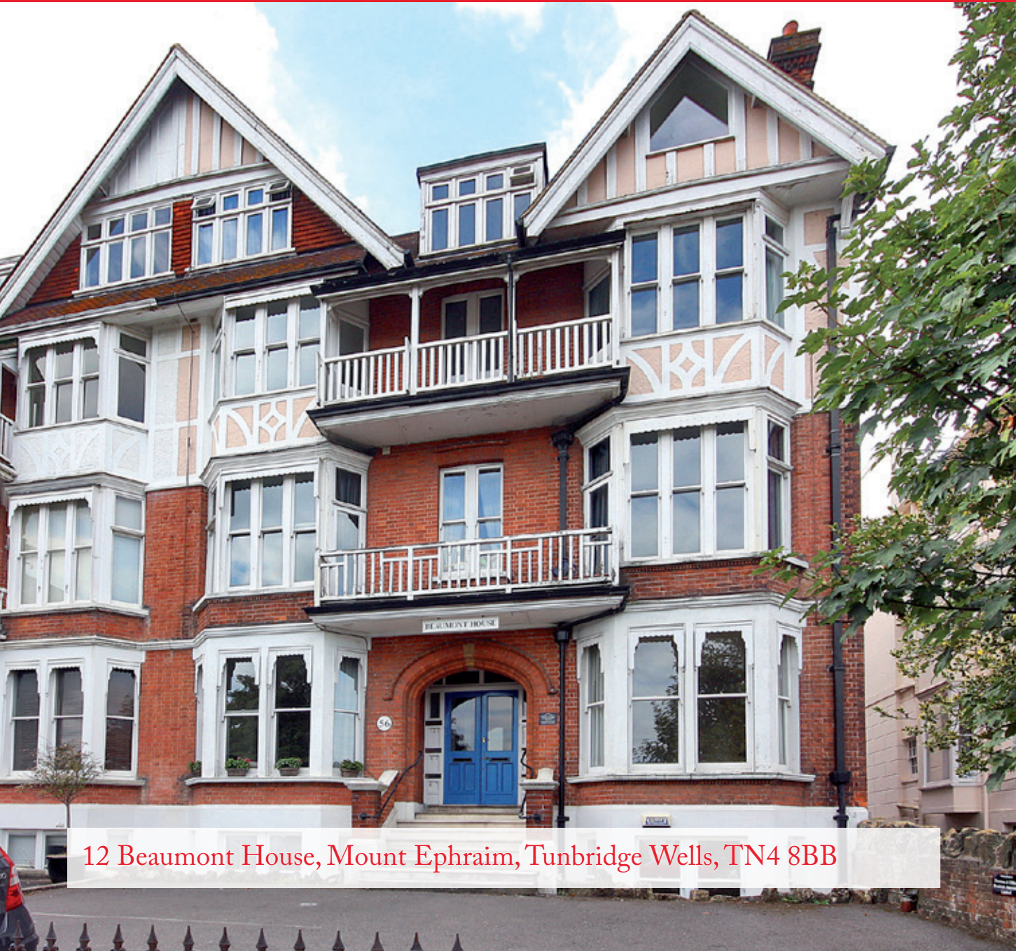
12 Beaumont House, Mount Ephraim, Tunbridge Wells, TN4 8BB