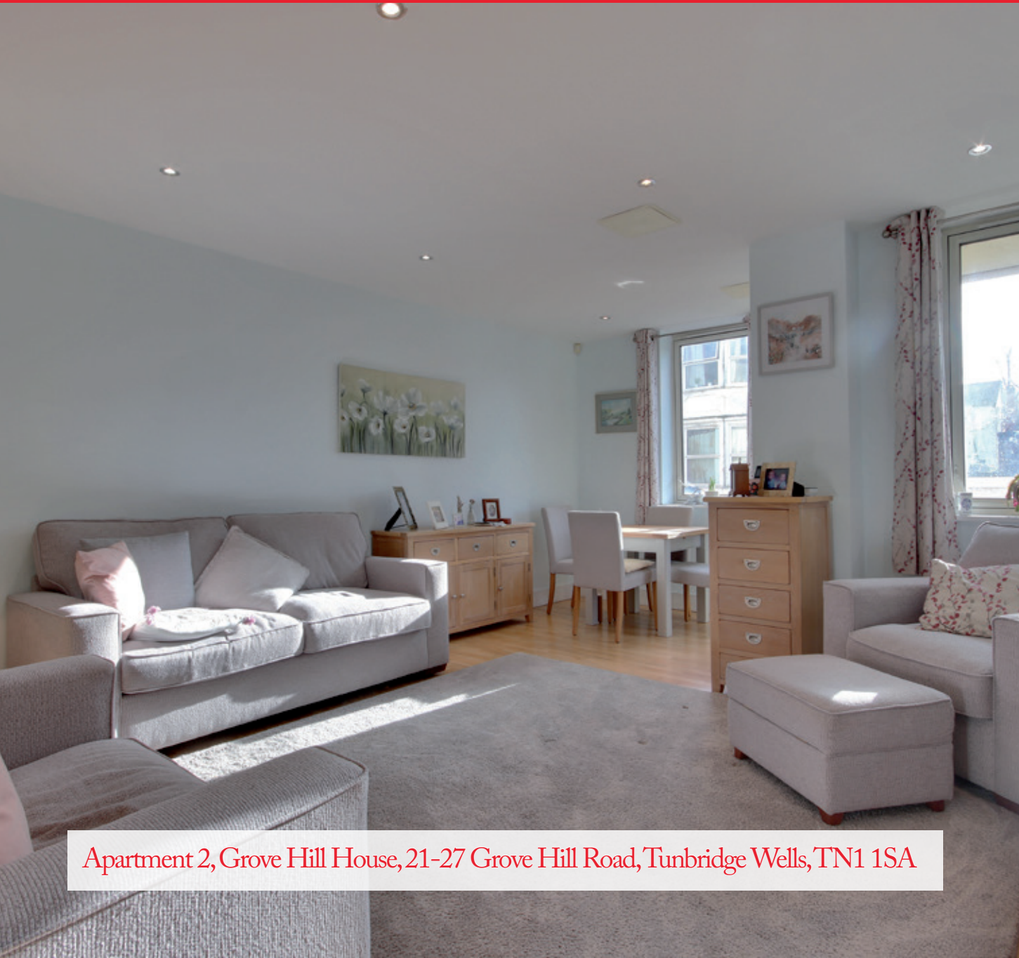
Apartment 2, Grove Hill House, 21-27 Grove Hill Road, Tunbridge Wells, TN1 1SA