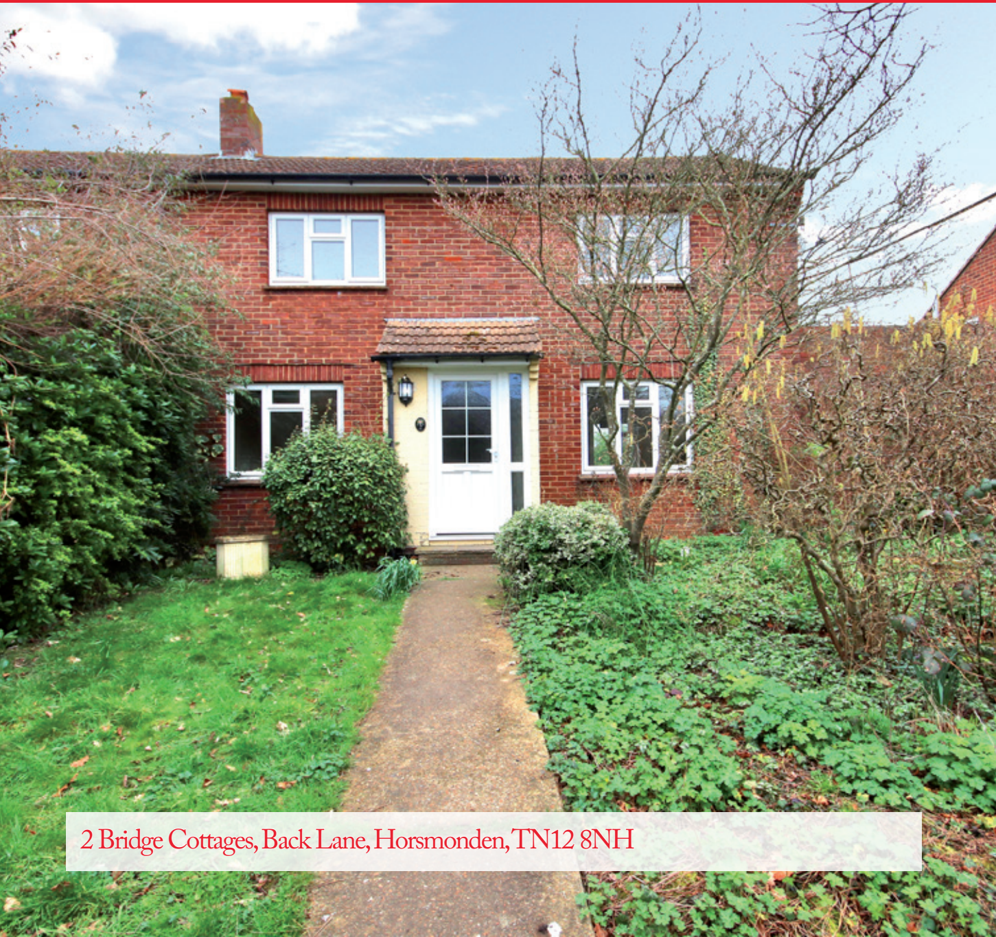
2 Bridge Cottages, Back Lane, Horsmonden, TN12 8NH