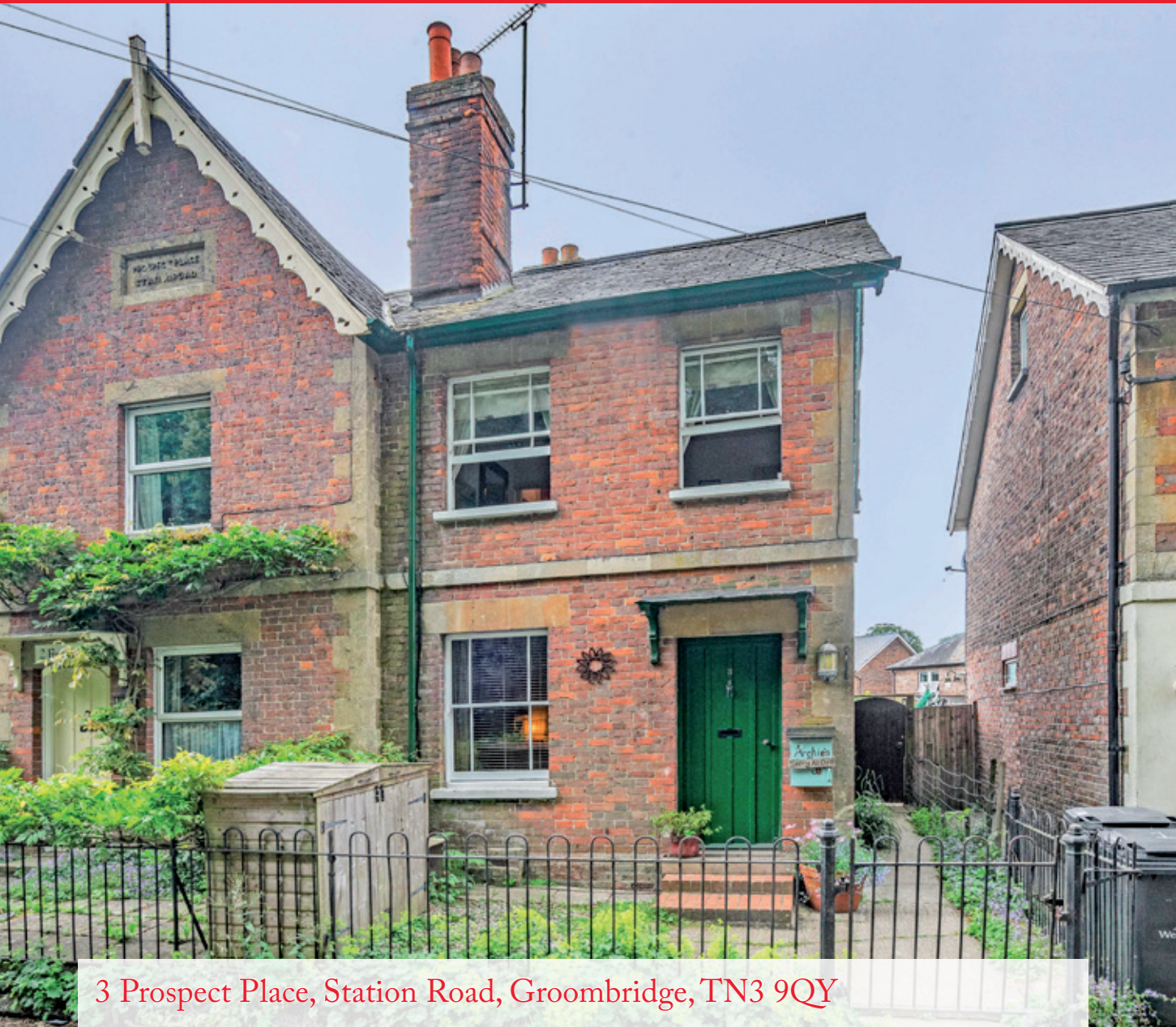
3 Prospect Place, Station Road, Groombridge, TN3 9QY