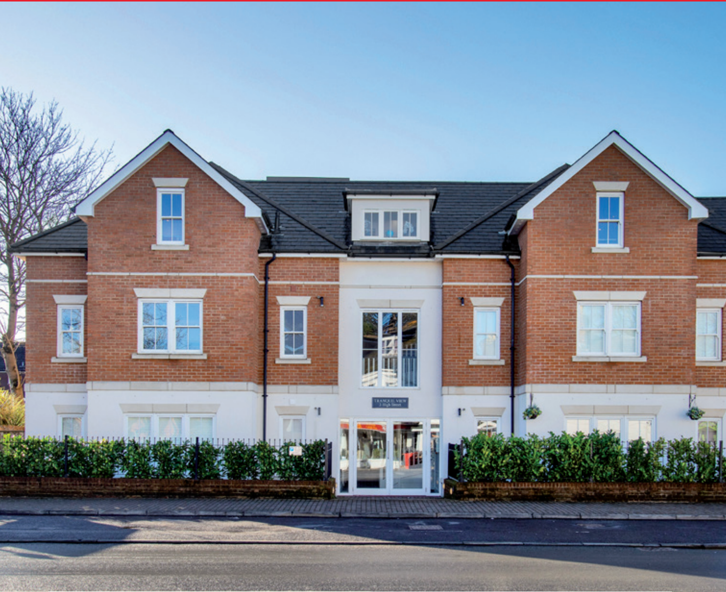
Penthouse, Tranquil View, 3 High Street, Pembury, TN2 4PH