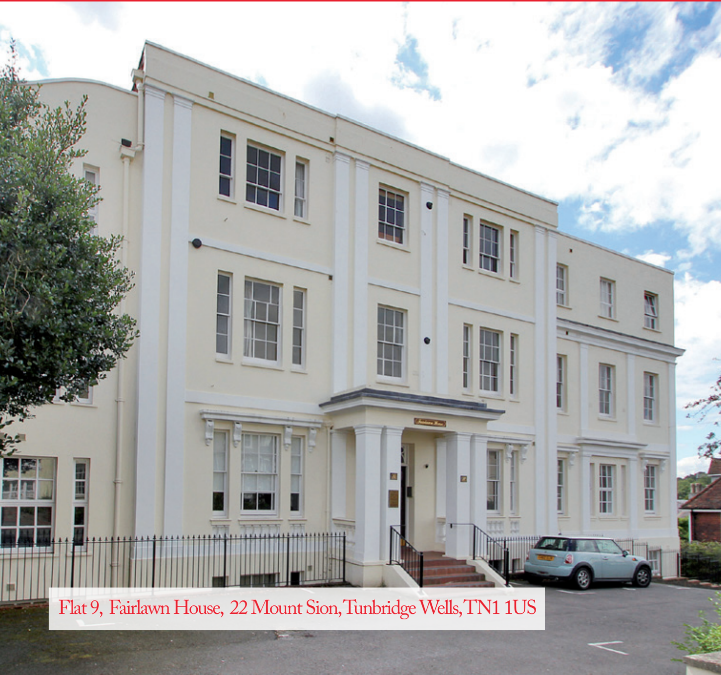
Flat 9, Fairlawn House, 22 Mount Sion, Tunbridge Wells, TN1 1US